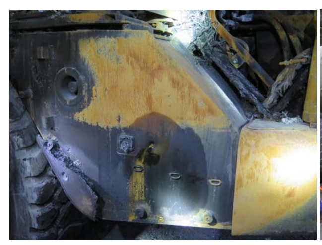
Figure 1 and 2: Damaged fuel tank with non-metallic cover consumed by fire

The truck's fuel tank was punctured, allowing diesel fuel to escape. The truck was being driven down the decline. At a local up-grade, the operator noticed additional drag on the engine and towards the top of the local climb the operator discovered a fire. The operator managed to escape from the truck without injury.