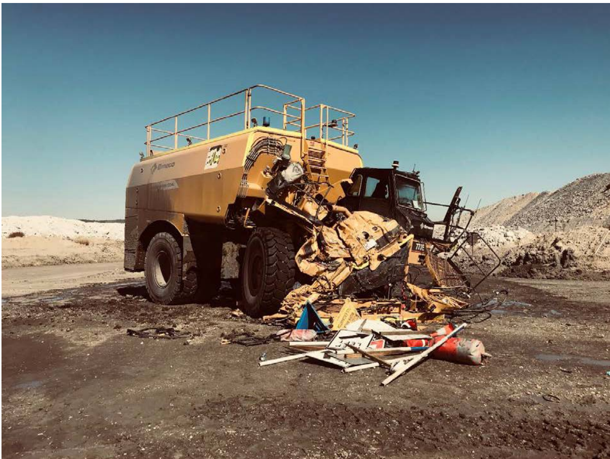
Figure 1 Damaged front end of service truck

On 7 May 2018, the Regulator published an investigation information release about the incident to share early investigation learnings with the mining industry.