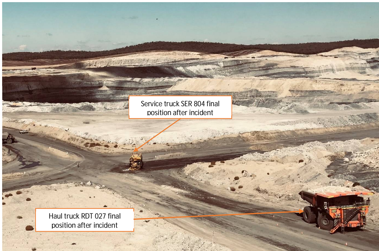
Figure 2 Four-way haul road intersection showing trucks involved in the collision

The Caterpillar 773D service truck was used to transport diesel and refuel mobile and fixed plant at the mine. It was a rigid framed vehicle and had a gross vehicle weight of 103 tonnes.